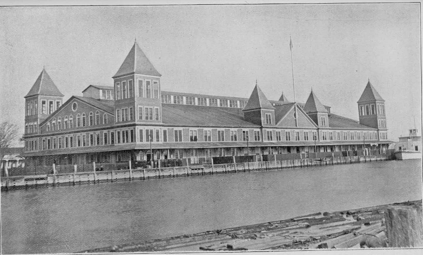
MAIN BUILDING ETC. ELLIS ISLAND NEW YORK HARBOR. View from southwest.